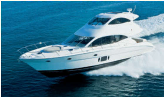
A60 OCEANS APART

The Maritimo vessels in this brochure show manufactured vessels for a particular geographical market and individual specification. They include standard and optional equipment and accessories that may be subject to change without notice. #90421 Maritimo A60 Aegean Enclosed. Design by www.weareonfire.co.nz .