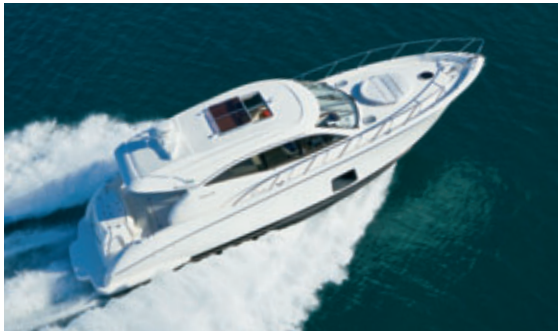
C50 OCEANS APART

The Maritimo vessels in this brochure show manufactured vessels for a particular geographical market and individual specification. They include standard and optional equipment and accessories that may be subject to change without notice. Design by www.weareonfire.co.nz . ideas@weareonfire.co.nz . #C50/90421.